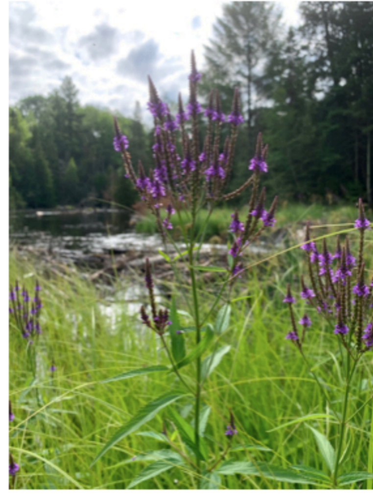
Blue Vervain— native